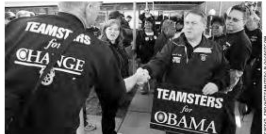
In January, Teamster President Jim Hoffa fumed: “A coordinated network . . . has for years been working toward passing these right-to-work . . . laws. Leading the charge is National Right to Work.”

“And that’s the basic problem for Jim Hoffa and company. The role of the Committee and its members is simply to help mobilize popular opposition to forced unionism and make it more effective.”